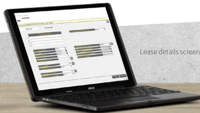
Lease details screen